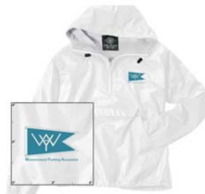
Share & Sell(TM) - LogoSportswear.com