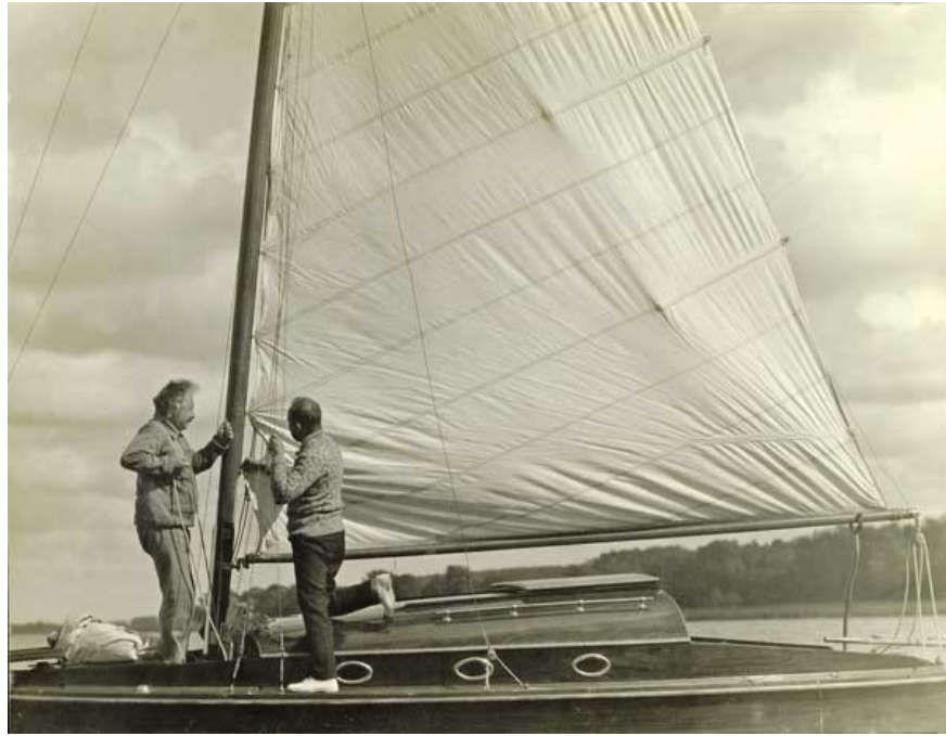
Albert Einstein told a reporter, "Atomic power is no more unnatural than when I sail my boat on Saranac Lake."

Though arguably one of the world's greatest minds, Albert Einstein was, in many ways, much like the rest of us. In his spare time, to sort out his thoughts, he didn't resort to an isolated ivory tower lined with dusty books, high above the world's concerns. He craved instead to get out on his boat. And if he ran that boat aground more often than he would've liked, perhaps we can let the occasional lack of seamanship slide, supposing that a eureka moment of inspiration may well have been distracting him.