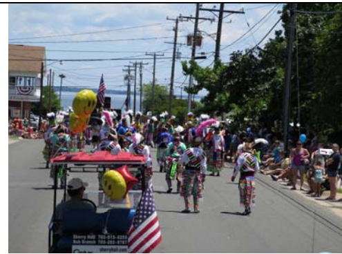
The Parade in Progress