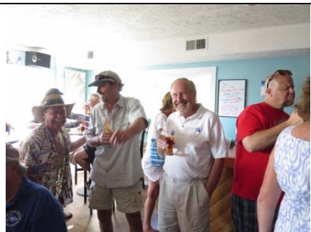
More of the crew enjoying