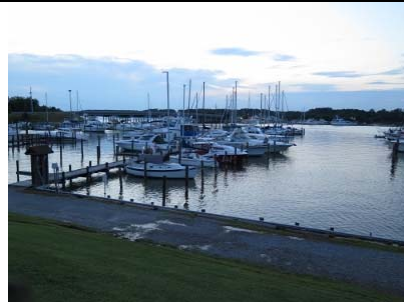
One reason we come – a nice marina to enjoy with friends