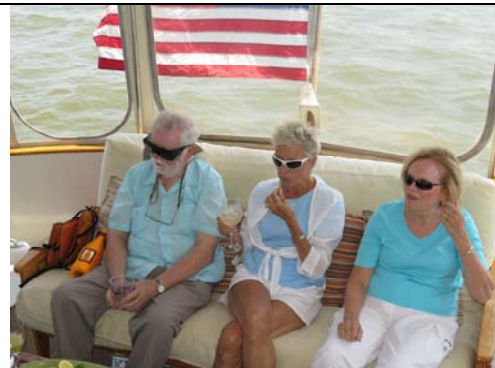
Relaxing on Apolonia's Back Deck