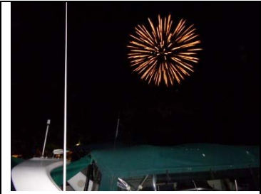
Fireworks at Tall Timbers.