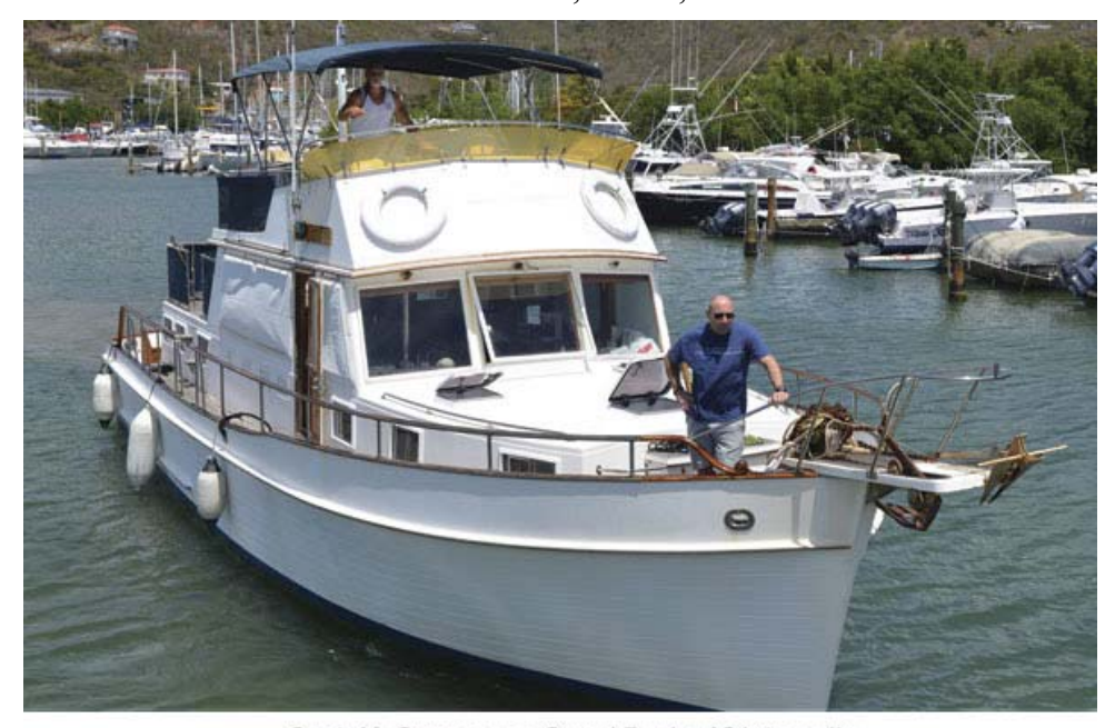
Capt. McCoy eases a Grand Banks 46 into a slip to replace this windlass as well with the same model as the 42.

Most likely, there's only one thing you can do—replace the darn thing as soon as possible, or, of course, have your favorite boatyard mechanic do the job in the same timely manner. Think about it. Almost every experienced boater knows a piece of iffy onboard machinery, like a faltering windlass for example, is gonna break down at the worst possible moment. You know, like, when it's just about midnight, with half a gale blowing, the anchor dragging, the tide going out like somebody's pulled the plug, and a big ol' pile of rocks licking its chops astern, lit by the grim gloom of the spreader lights. Why take chances?