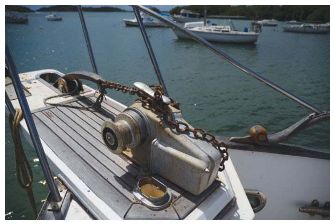
The old windlass.

Once the 42's Bruce anchor was cut loose and carried ashore, McCoy could then tail the old rusted rode out on deck (atop a cardboard underlayment to protect teak planking) and ultimately take it ashore as well. "After you've removed the bolts and washers underneath the mounting area and separated the old windlass (it weighed about 60 pounds) from the electrical cables," advises McCoy, "you've got to be really careful lifting it out—it's heavy. Don't drop it!"