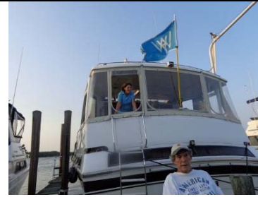
Apolonia flying the burgee.